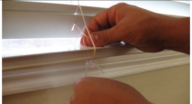
Step 5 – Push the life cord through the bottom rail and retie the knot.