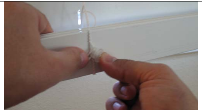
Step 6 – Stuff the lift cord and ladder back into the holes in the bottom rail and replace bottom rail plugs. You're done!