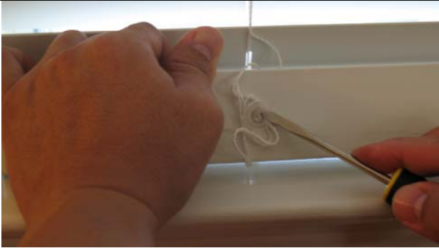
Step 1 – Remove the bottom rail plugs.

Sometimes a horizontal slat will become damaged and the need of replacing it will arise. It would be a great deal more pleasant to go ahead and do the repair in the home. It's possible and extremely simple. Here's how: