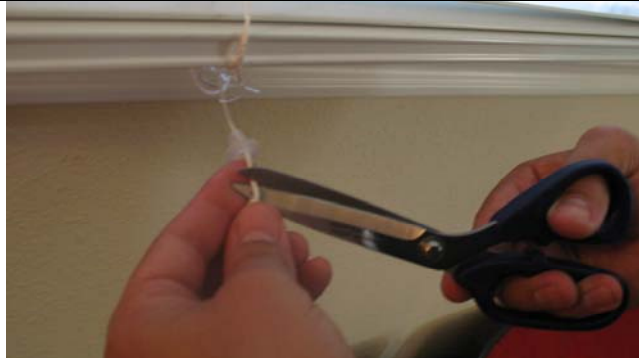
Step 2 – Under the plugs you will find the ladder and knotted lift cord. Push the ladder aside and pull the lift cord out and cut the knot.